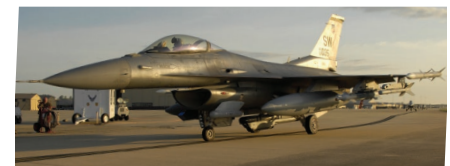
Preserved buffer land benefits vehicle maneuver exercises (top) and F-16 training (bottom).